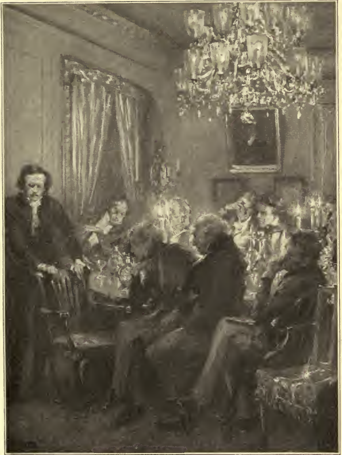
Grasped the back of the chair reserved for him